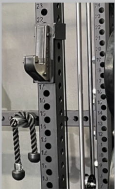
Laser cut numbering on uprights.