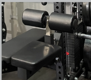
Optional seat and foot rest available separately.